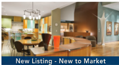
New Listing - New to Market