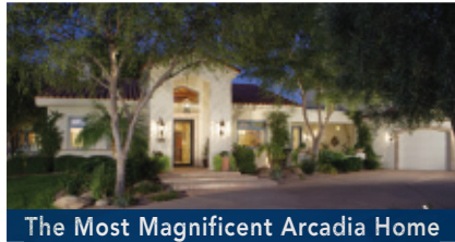
The Most Magnificent Arcadia Home